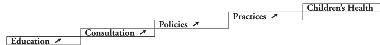
Figure 1: CCHP’s Stepwise Model of How Health Consultation Improves Children’s Health

In Crowley’s ecological model of child care health consultation (Figure 2), 55 the CCHC is a “supportive link among families, child care providers, and the health care system.” Crowley describes a family-centered model based on Bronfenbrenner’s ecological theory of human development. In this model, the child and family move between microsystems including child care and health care. These microsystems exist within a context of regulatory infrastructure ultimately influenced by social policy and culture. Positive child and family development is supported by “the degree of mutual trust, positive orientation, and goal consensus among these microsystems.” Family and child development is enhanced when the larger context of regulations and policy is influenced.